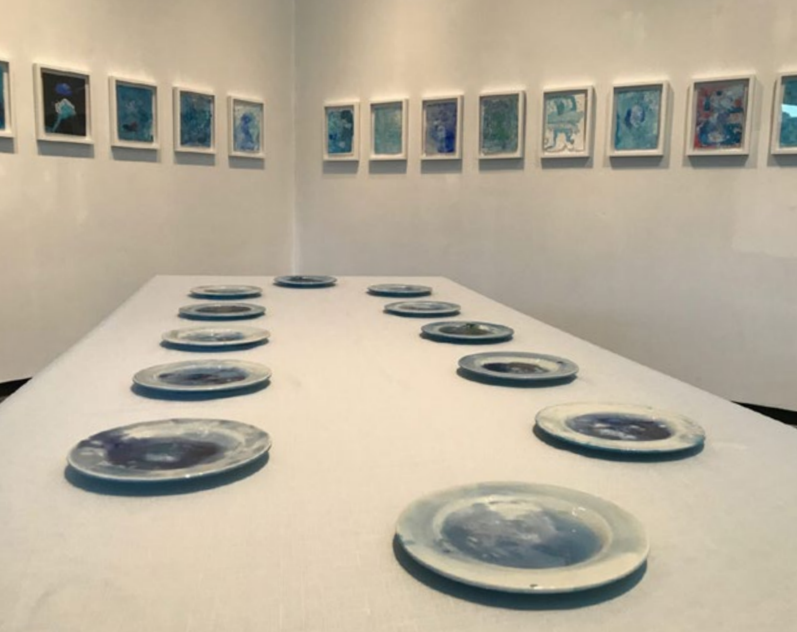
Xavier Cortada, "North Pole Dinner Party plates," Arctic melted ice, underglaze, glaze on ceramic, 2008. (North Pole Dinner Party Installation at 90N in 2018.)